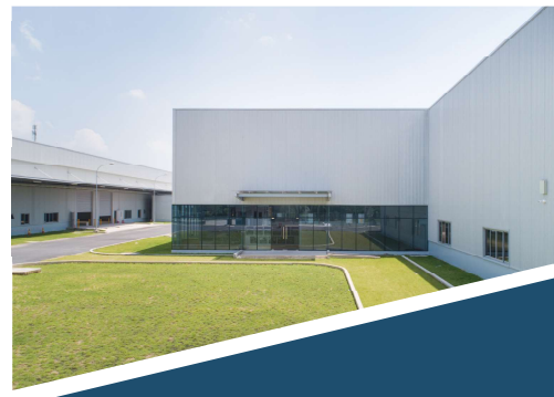
Actual photos of Phase 1